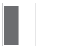
Vertical half page w91mm x h250mm