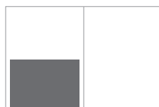
Horizontal half page w186mm x h124mm