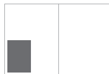
Vertical quarter w91mm x h123.5mm