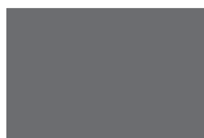
Double page spread w420mm x h275mm + 3mm bleed